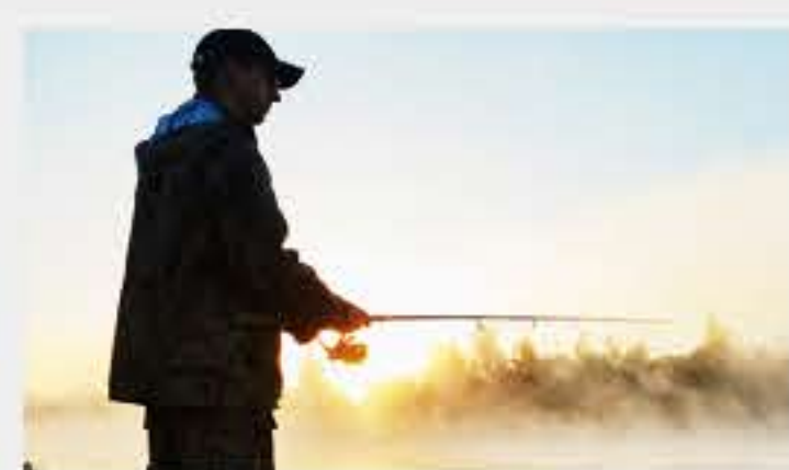
Fishing at Leguwa