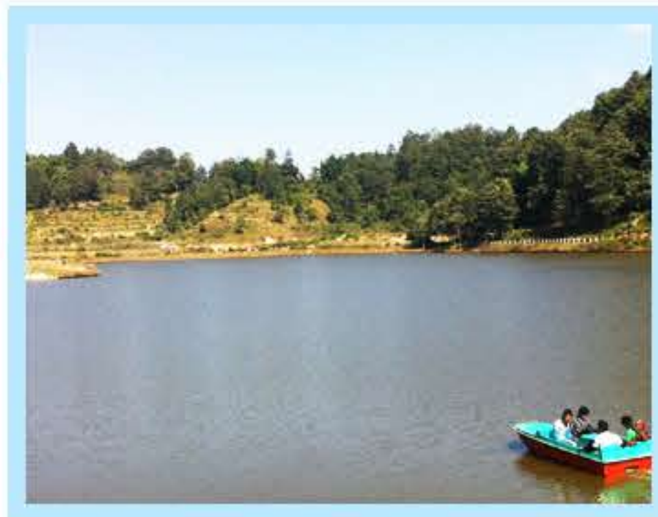
Raja Rani Taal