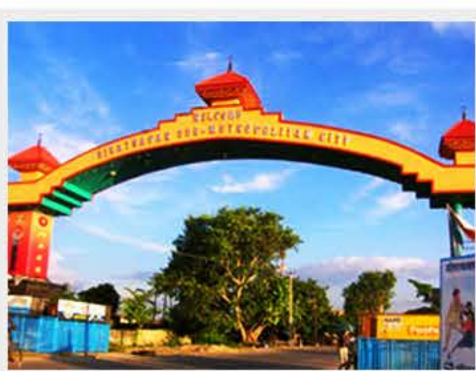
Drive to Biratnagar